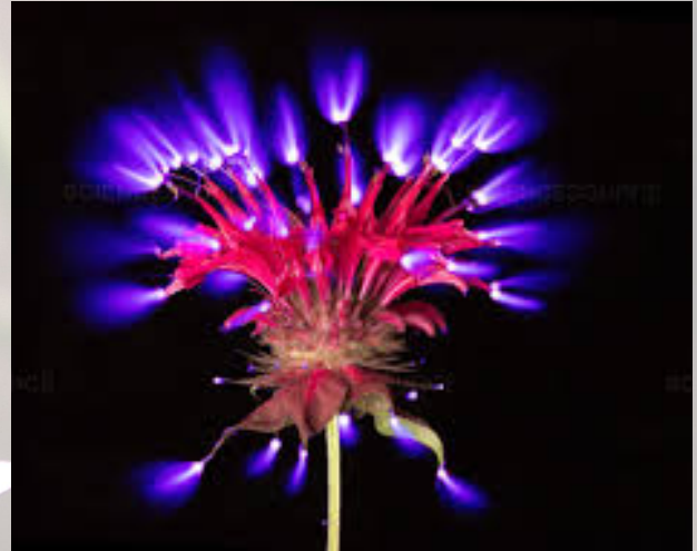
Bee Balm Energy captured on Kirlian Photography